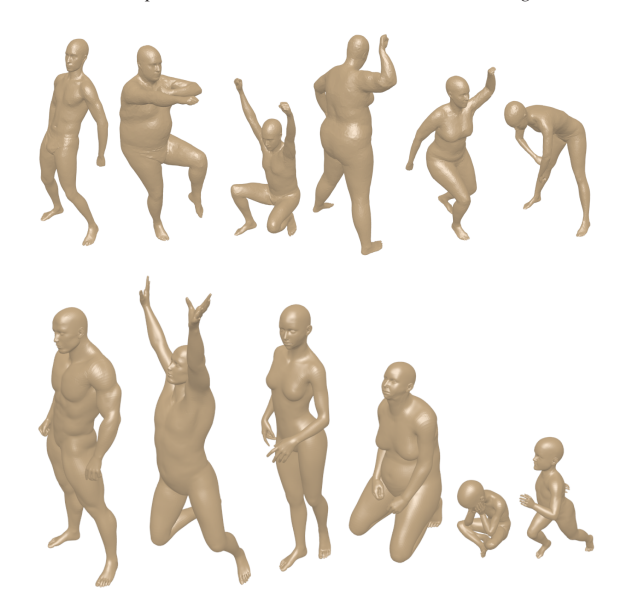
Figure 1: A selection of models included in our datasets. Above: Real dataset, below: Synthetic dataset.