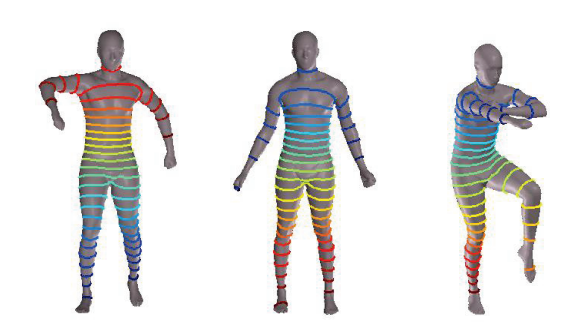
Figure 3: The isocontours of the second eigenfunction.